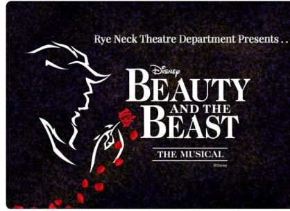
BEAUTY AND THE BEAST